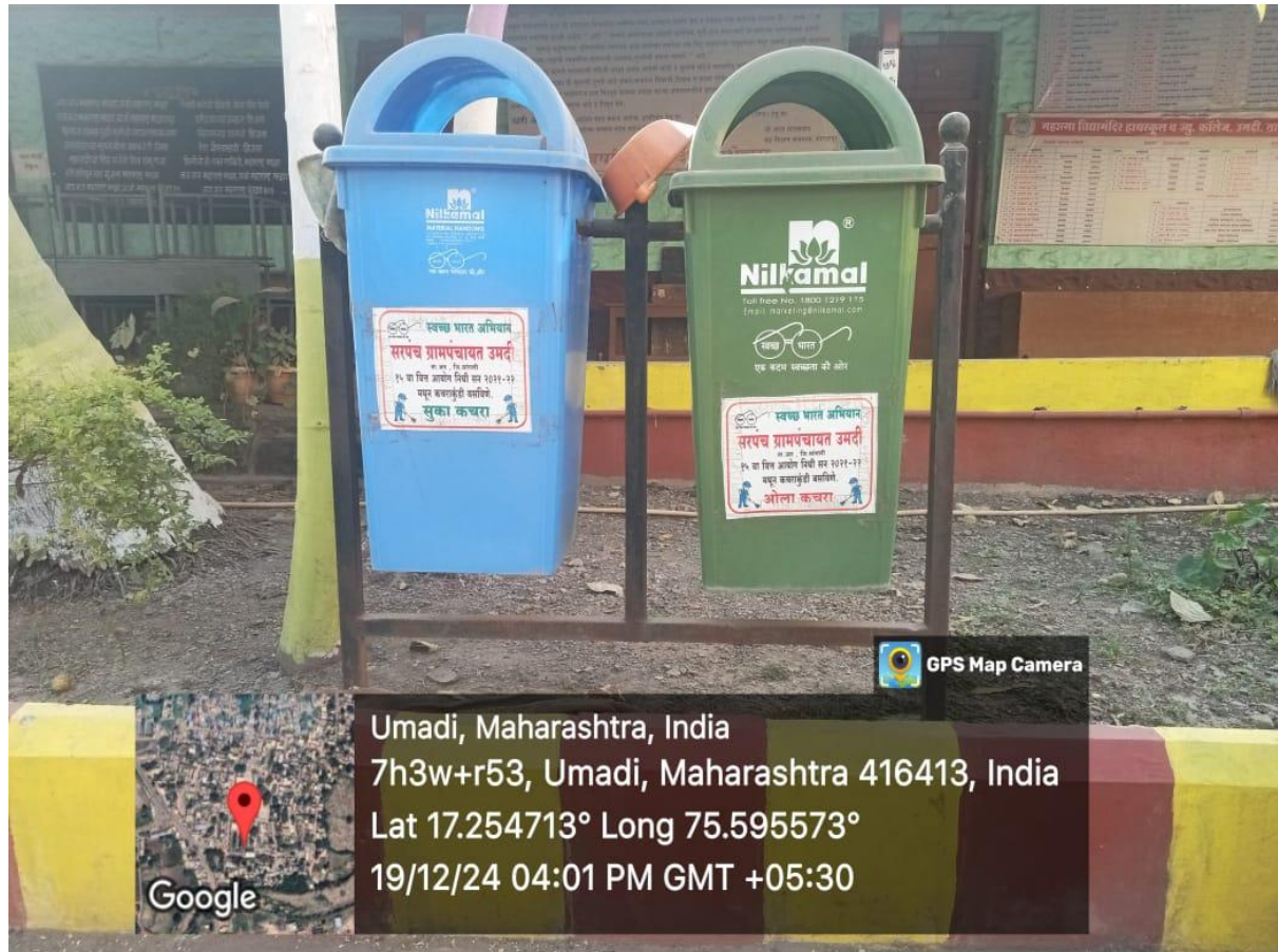
Dry and Wet Waste Dustbin combine