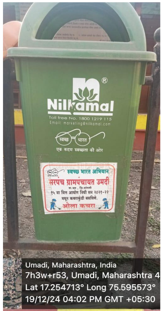
Dry Waste Dustbin

Umadi, Maharashtra, India 7h3w+r53, Umadi, Maharashtra 4 Lat 17.254713° Long 75.595573° 19/12/24 04:02 PM GMT +05:30