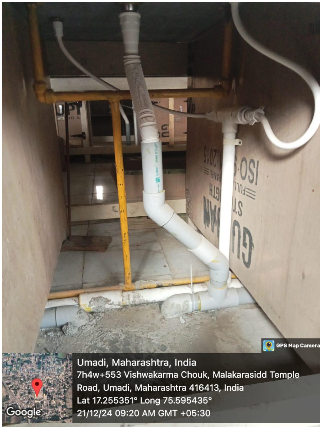
Distribution of liquid waste through pipe