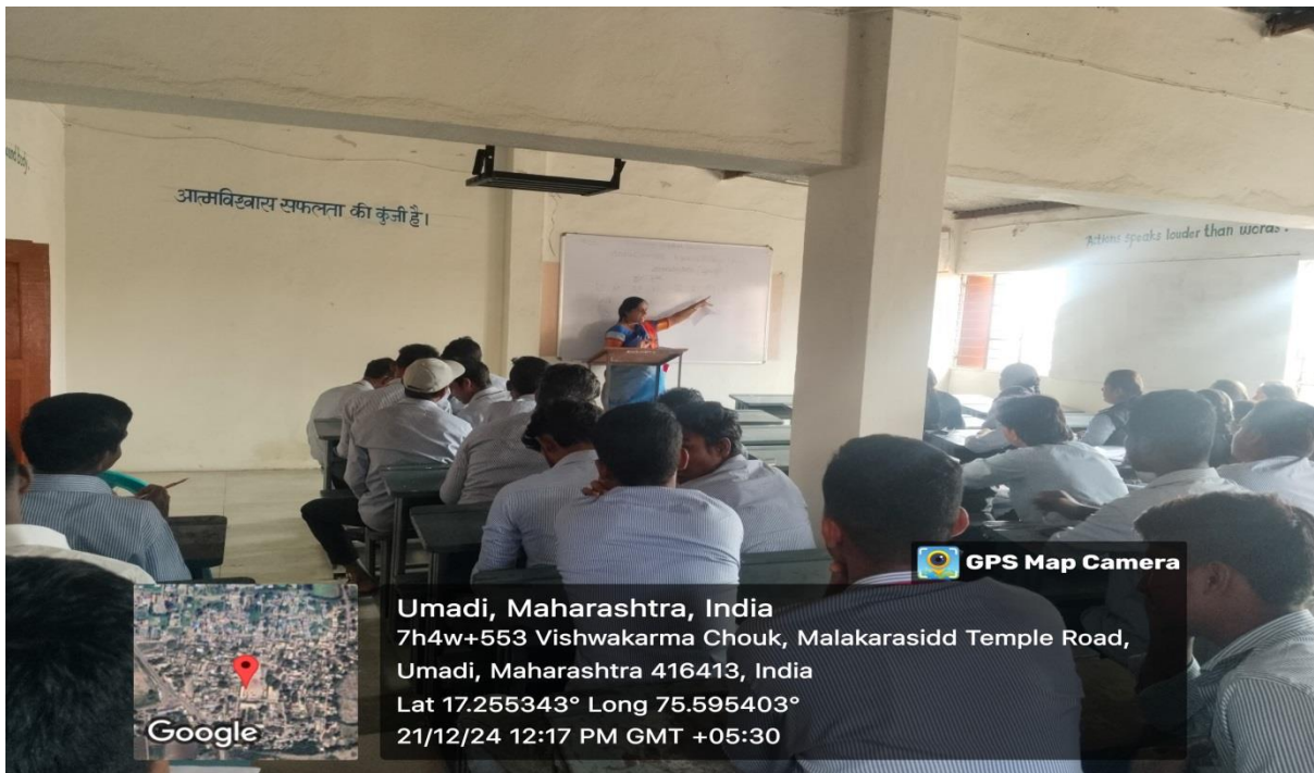
Kannada Lecture Delivered to Marathi students by Principal Madam